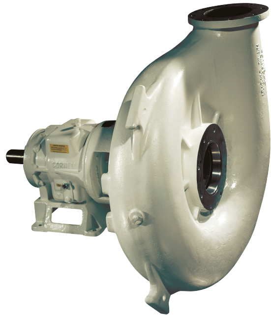
A typical picture of the pump is shown. Please contact Gemstone Pump Company for further details. All information is approximate and for general guidance only.