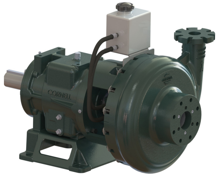
A typical picture of the pump is shown. Please contact Gemstone Pump Company for further details. All information is approximate and for general guidance only.