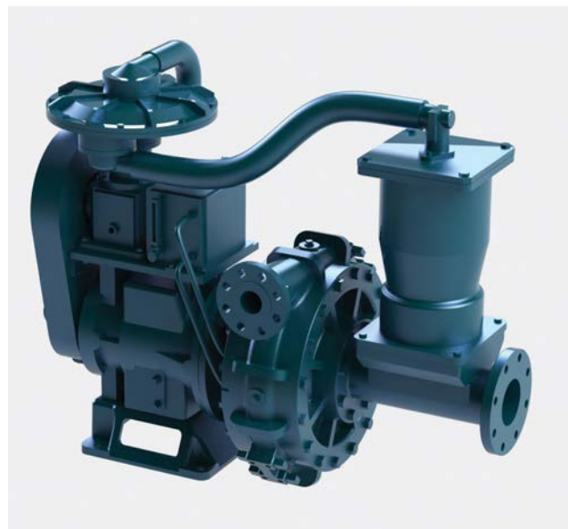
A typical picture of the pump is shown. Please contact Gemstone Pump Company for further details. All information is approximate and for general guidance only.