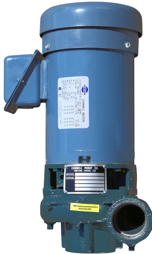
A typical picture of the pump is shown. Please contact Gemstone Pump Company for further details. All information is approximate and for general guidance only.

The 2C Edge End Gun Booster pump is designed with Gemstone's renowned quality and durability. It features a 2" discharge, 2.5" suction, and enclosed impeller. Gemstone's patented Cycloseal® design is standard.