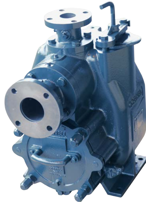
A typical picture of the pump is shown. Please contact Cornell Pump Company for further details. All information is approximate and for general guidance only.