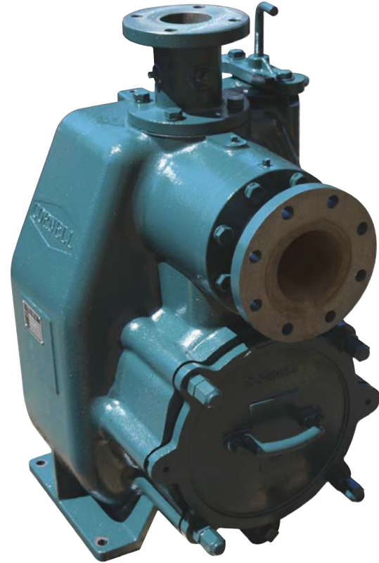
A typical picture of the pump is shown. Please contact Gemstone Pump Company for further details. All information is approximate and for general guidance only.