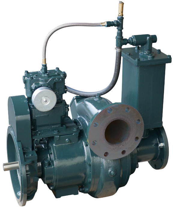
A typical picture of the pump is shown. Please contact Gemstone Pump Company for further details. All information is approximate and for general guidance only.