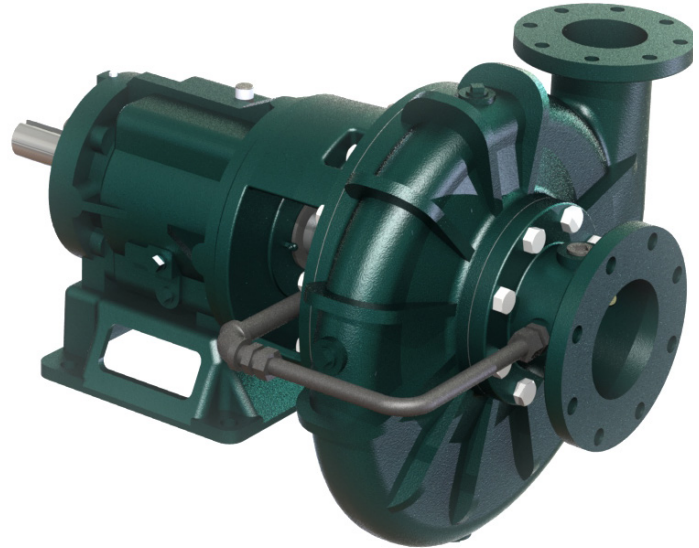
A typical picture of the pump is shown. Please contact Gemstone Pump Company for further details. All information is approximate and for general guidance only.