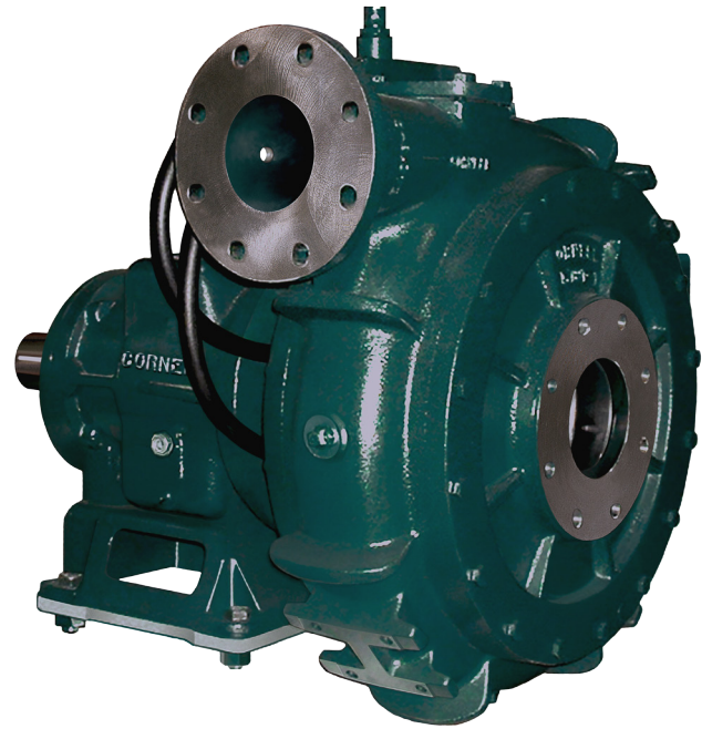
A typical picture of the pump is shown. Please contact Gemstone Pump Company for further details. All information is approximate and for general guidance only.