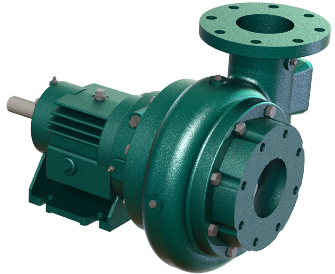
A typical picture of the pump is shown. Please contact Gemstone Pump Company for further details. All information is approximate and for general guidance only.