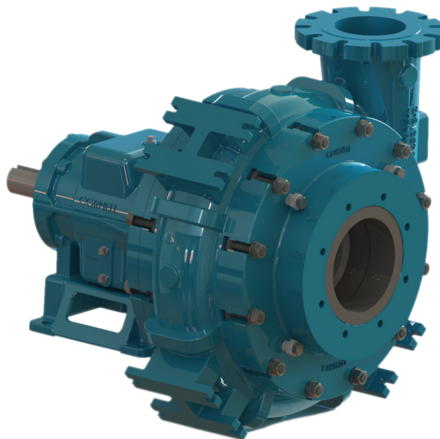
A typical picture of the pump is shown. Please contact Gemstone Pump Company for further details. All information is approximate and for general guidance only.