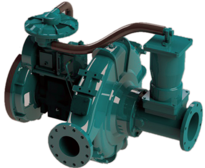
A typical picture of the pump is shown. Please contact Gemstone Pump Company for further details. All information is approximate and for general guidance only.