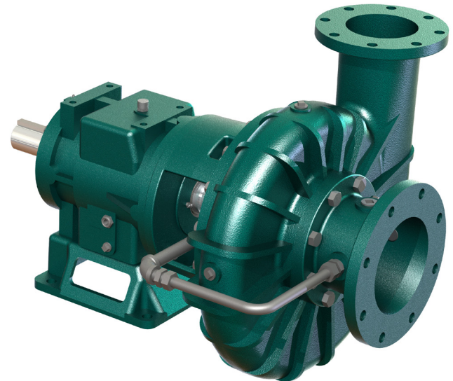
A typical picture of the pump is shown. Please contact Gemstone Pump Company for further details. All information is approximate and for general guidance only.