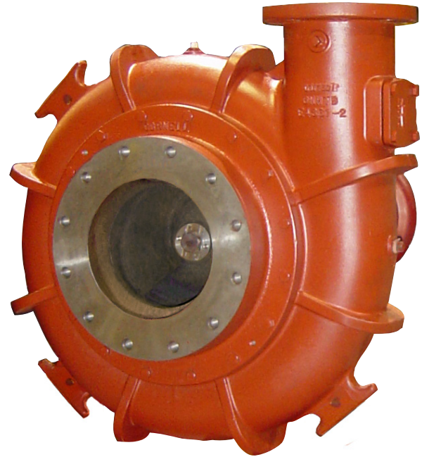
A typical picture of the pump is shown. Please contact Gemstone Pump Company for further details. All information is approximate and for general guidance only.