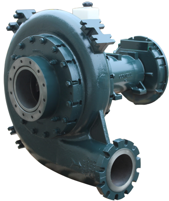
A typical picture of the pump is shown. Please contact Gemstone Pump Company for further details. All information is approximate and for general guidance only.