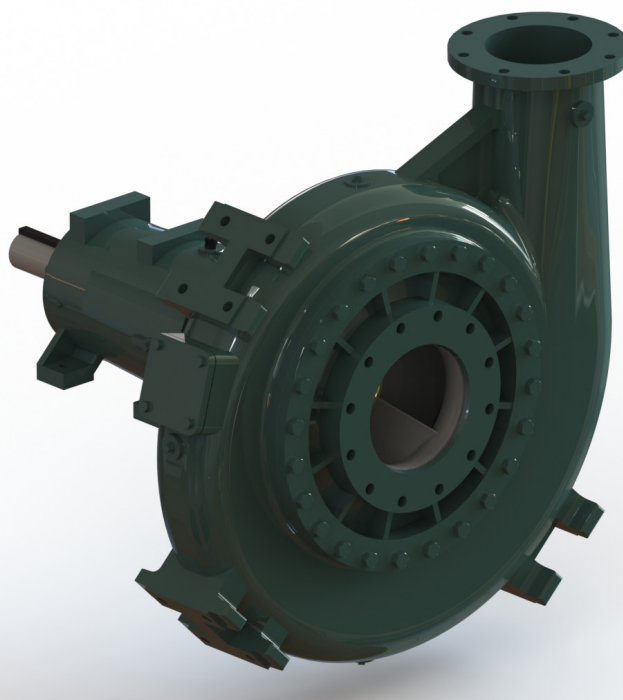
A typical picture of the pump is shown. Please contact Gemstone Pump Company for further details. All information is approximate and for general guidance only.