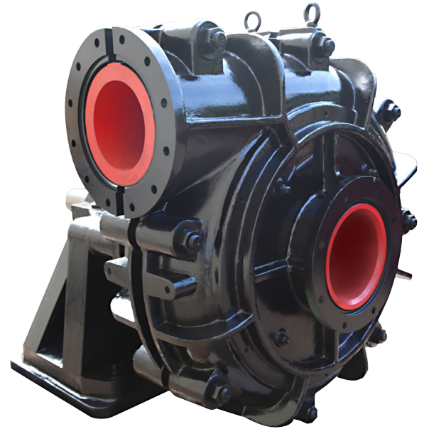
A typical picture of the pump is shown. Please contact Gemstone Pump Company for further details. All information is approximate and for general guidance only.