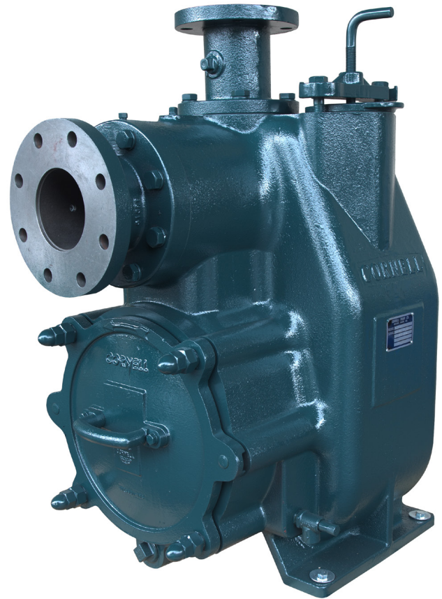
A typical picture of the pump is shown. Please contact Gemstone Pump Company for further details. All information is approximate and for general guidance only.

Gemstone's self-priming pump, with industry-leading efficiency, runs several percentage points higher than other manufacturers. Features patented Cycloseal ® backplate and uniquely designed volute for best performance, with a 8" suction and 8" discharge.